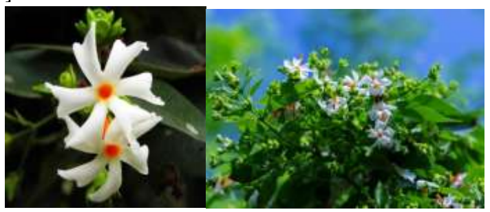
Fig 1: Nyctanthes Arbortristis Linn.

germination[3]. The plants used as drugs are fairly innocuous and comparatively free from toxic effects or were so toxic that lethal effects were well-known. The character has provided the storehouse of remedies to cure al ailments of mankind[4]. Since ages, man has been captivated with N. arbortristis for curing various body diseases. From ancient civilization various parts of various plants were accustomed pain, control suffering and counteract disease. Most of the drugs utilized in primitive medicine were obtained from plants and are the earliest and principle N. arbortristis source of medicines[5]. The employment of the medicinal flowers and plant parts for curing illnesses or diseases has been documented in history of all civilizations. The interest in medicinal and fragrant flowers has been shown everywhere the planet due to their safe and effective energetic principles.[6] The orange heart is employed for dyeing silk and cotton, this practice was started with Buddhist monks whose orange robes got their colour by this flower. The Parijata is regarded in Hindu mythology united of the five wish-granting trees of Devaloka [5]. Different parts of Nyctanthes arbor-tristis are known to have for treatment of assorted ailments by tribal people of India especially Orissa and Bihar together with its use in Ayurveda, Siddha and Unani systems of medicines[7,8]