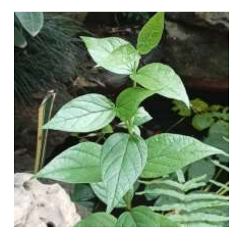
Fig.4 Leaves of Nyctanthes arbor-tristis

Leaves: The leaves of Nyctanthes arbor-tristis Linn are used extensively in Ayurvedic medicine for the treatment of varied diseases like sciatica, chronic fever, rheumatism, and internal worm infections, and as a laxative, diaphoretic and diuretic. Leaves are utilized in cough reduction. Leaf juice is mixed in honey and given thrice daily for the treatment of cough. Paste of leaves is given with honey for the treatment of fever, high vital sign and diabetes. Juice of the leaves is employed as digestives, antidote to reptile venoms, mild bitter tonic, laxative, diaphoretic and diuretic. Leaves are employed in the enlargement of spleen. The leaf juice is employed to treat loss of appetite, piles, liver disorders, biliary disorders, intestinal worms, chronic fever, obstinate sciatica, rheumatism and fever with rigors. The extracted juice of leaves acts as a cholagogue, laxative and mild bitter tonic. It's given with little sugar to children as a remedy for intestinal.[18] The plants leaves are having immense medicinal value and are thus commercially exploitable. It's popular garden shrub that grows to a height of three.0-4.5 m and holds a vital role in conditions associated with fever and inflammation.[19]