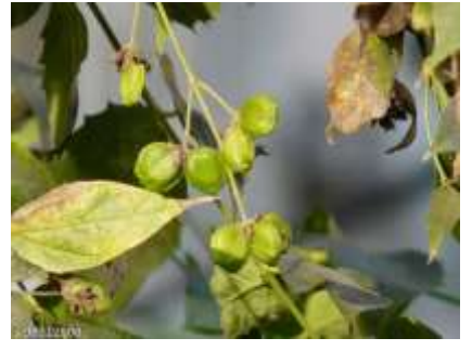
Fig.2 Nyctanthus arbor-tristis seeds

Seeds: Seeds employed in diabetes, also in cutaneous diseases. Filaments— astringent and cooling; prescribed for bleeding piles and menorrhagia. Plant—toxic on the nervous system.