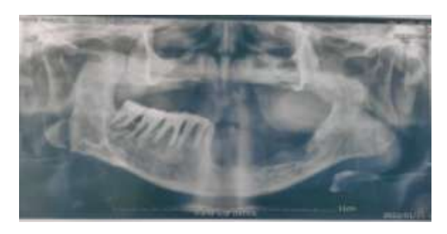
Figure 4: Orthopantomogram of patient