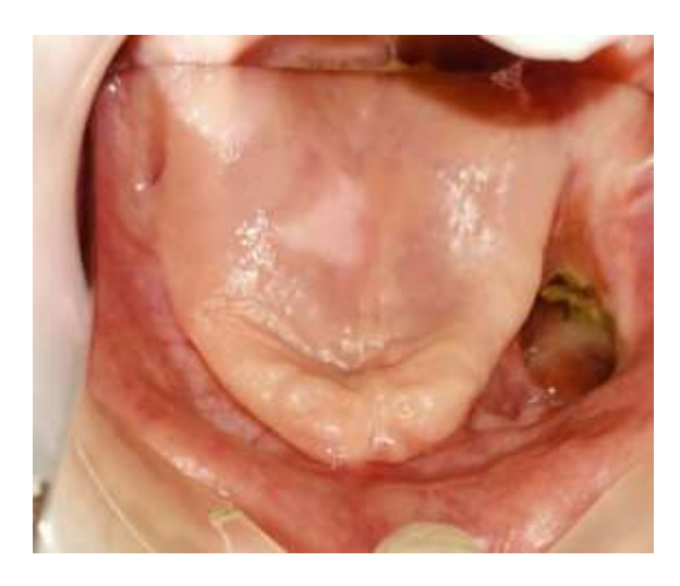
Figure 2: Intraoral examination of defect area