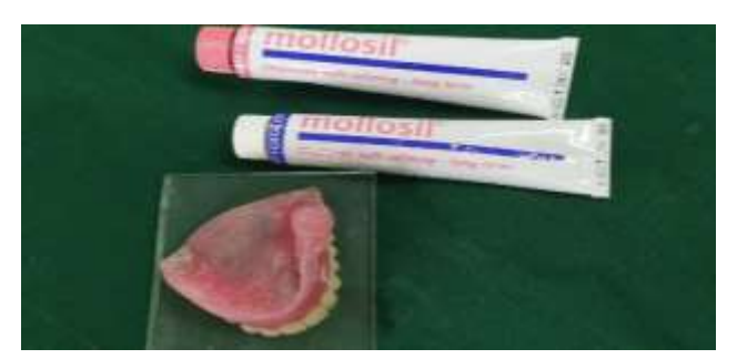
Figure 9- Permanent soft liner

Since the ridge was resorbed, the maxillary denture was lined by chairside permanent soft liner (mollosil relining material, detaxgermany) so as to incorporate the undercuts for the retention without harming the underlining sensitive tissue. first the adhesive was applied then the soft silicone material was applied to the intaglio surface of denture and placed in patient's mouth as per instruction given with product. after polishing and finishing the varnish is applied with the painting brush (Figure 9).