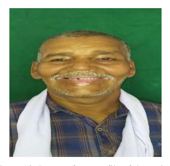
Figure 10- Post-op front profile of the patient

Finally, the obturator prosthesis was inserted in the patient mouth (Figure 10). Patient was happy and satisfied with his improved function, speech, and esthetics.