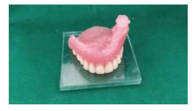
Figure 7- Maxillary denture with obturator