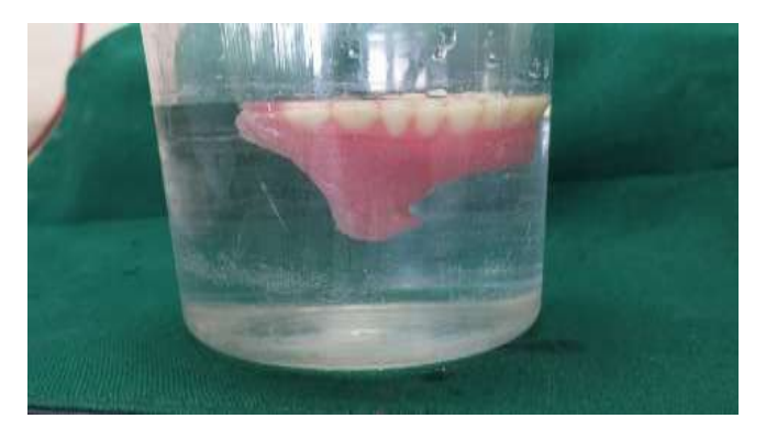
Figure 8- Hollow maxillary denture