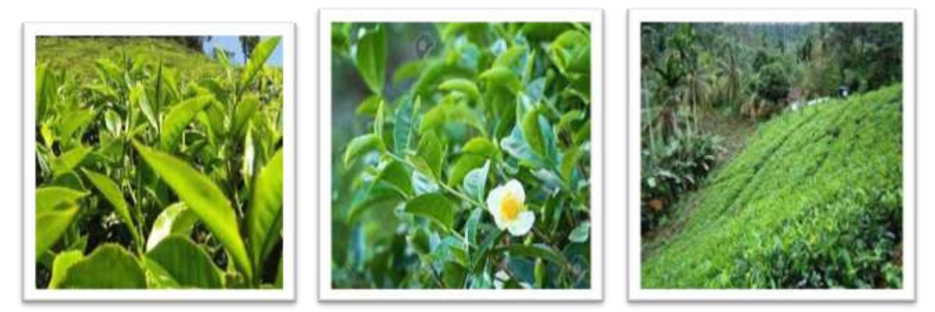
Green Tea Leaves

Indigenous to East Asia, South East Asia and the Indian subcontinent (Table 4 & 5), Camellia sinensis is cultivated today in tropical and subtropical regions throughout the world. The tea plant thrives in sunny climates where the temperatures are hot and rain is regular and plentiful, with a growing season that stretches for at least eight months of the year. Generally there are three growing spurts within the growing season. The Spring shoots grow from the end of March to the beginning of May and this is the period when the plant is most bountiful. From early June to the start of July the second growing stage takes place and the season comes to an end with the final flux of growth occurring from mid July to October. Camellia sinensis is happiest in acidic conditions and grown in a range of soils. The perfect soil mix is "sandy loam" which consists of approximately 40% sand, 40% silt and 20% clay, allowing the water to drain well out the soil while still enabling it to trap all the essential nutrients the plant requires from the earth. (5)