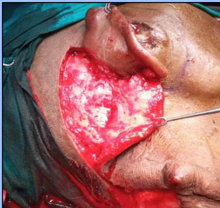
Figure - 3

The flaps was raised superficial to the superficial musculoaponeurotic system (SMAS) and the parotidomasseteric fascia, deep to the platysma, (Figure 3,4) and then transferred into the outer skin defect and sutured.(Figure 5,6) without tension.