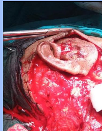
Figure - 4