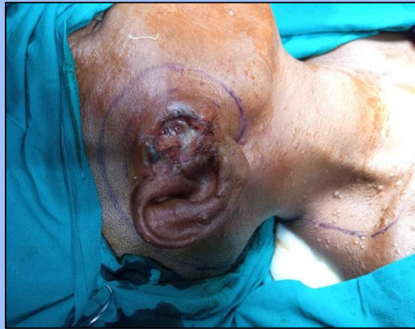
Figure - 2

The flaps was raised superficial to the superficial musculoaponeurotic system (SMAS) and the parotidomasseteric fascia, deep to the platysma, (Figure 3,4) and then transferred into the outer skin defect and sutured.(Figure 5,6) without tension.