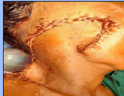
Figure - 6