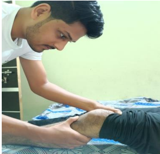
Figure 3 Therapist Performing Lachman Test