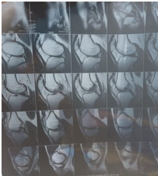
Figure 2 MRI (Image) of the Patient