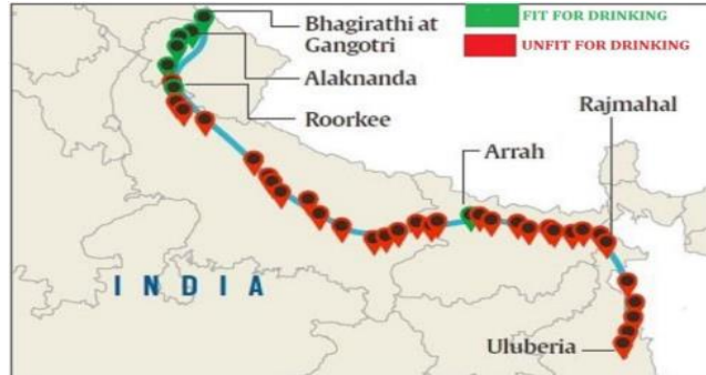
FIG:2- POLLUTION LEVEL IN GANGA

Ganges forms its Delta at the Bay of Bengal. The Ganges travels a distance of 1557 miles beginning from the point of origin till the ultimately merge into the ocean. Due to various human and industrial activities the level of pollution in Ganga river was at its peak in year 2013. “Namami Gange programme” was launched in June 2014 with budget outlay of Rs. 20,000 Crore to accomplish the twin objective of effective abatement of pollution, conservation and rejuvenation of national River Ganga.