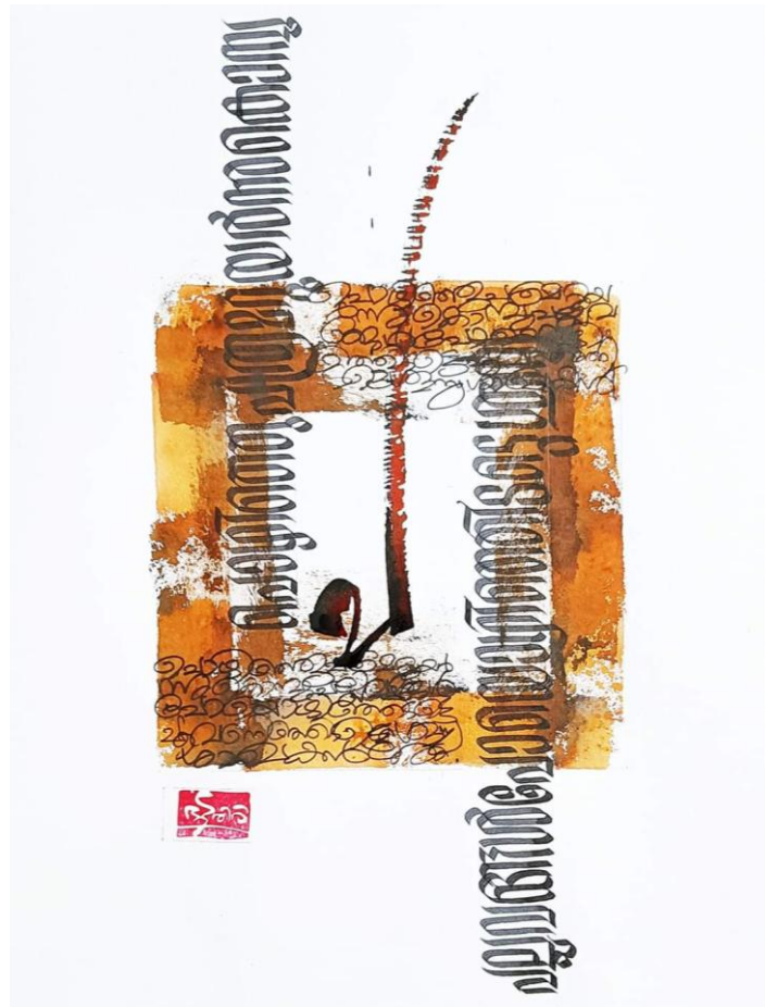
Figure.3, Malayalam calligraphy 4117, mixed medium on paper, Narayana Bhattathiri, 2023

pattern in both works, use of same quality paper and the same size are creating the each works visual similarities. In both works the words are different but his exceptional skill of arranging Malayalam alphabets into calligraphy creating the workspecial.His works are combination of different calligraphy.