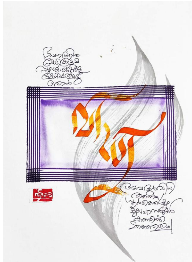
Figure.8, malayalam calligraphy 4075, mixed medium on paper, Narayana Bhattathiri, 2023