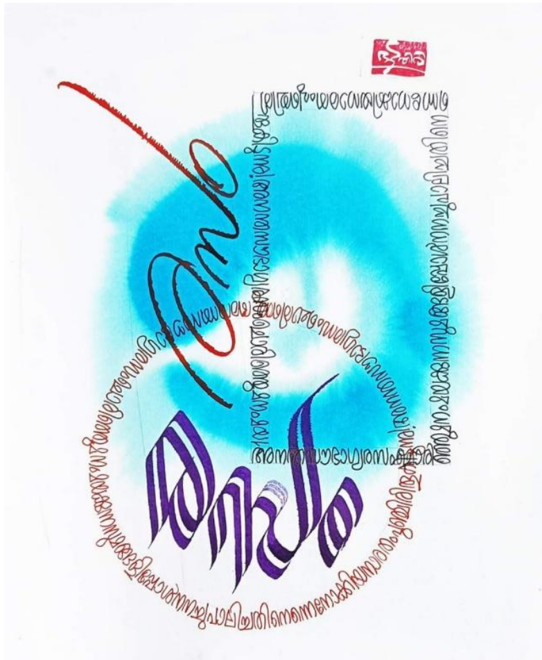
Figure.9, malayalam calligraphy 4053,mixed medium on paper, Narayana Bhattathiri, 2023

In figure 8 works cansee the how artist using the multiple geometrical forms circle and rectangle. Use of different calligraphy styles within the composition. Overlapping the colours making special effects.