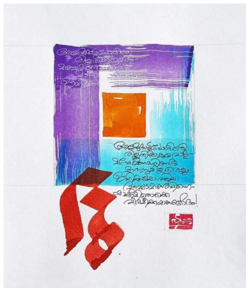
Figure.10, malayalam calligraphy 4064, mixed medium on paper, Narayana Bhattathiri, 2023

In figure 8 works cansee the how artist using the multiple geometrical forms circle and rectangle. Use of different calligraphy styles within the composition. Overlapping the colours making special effects.