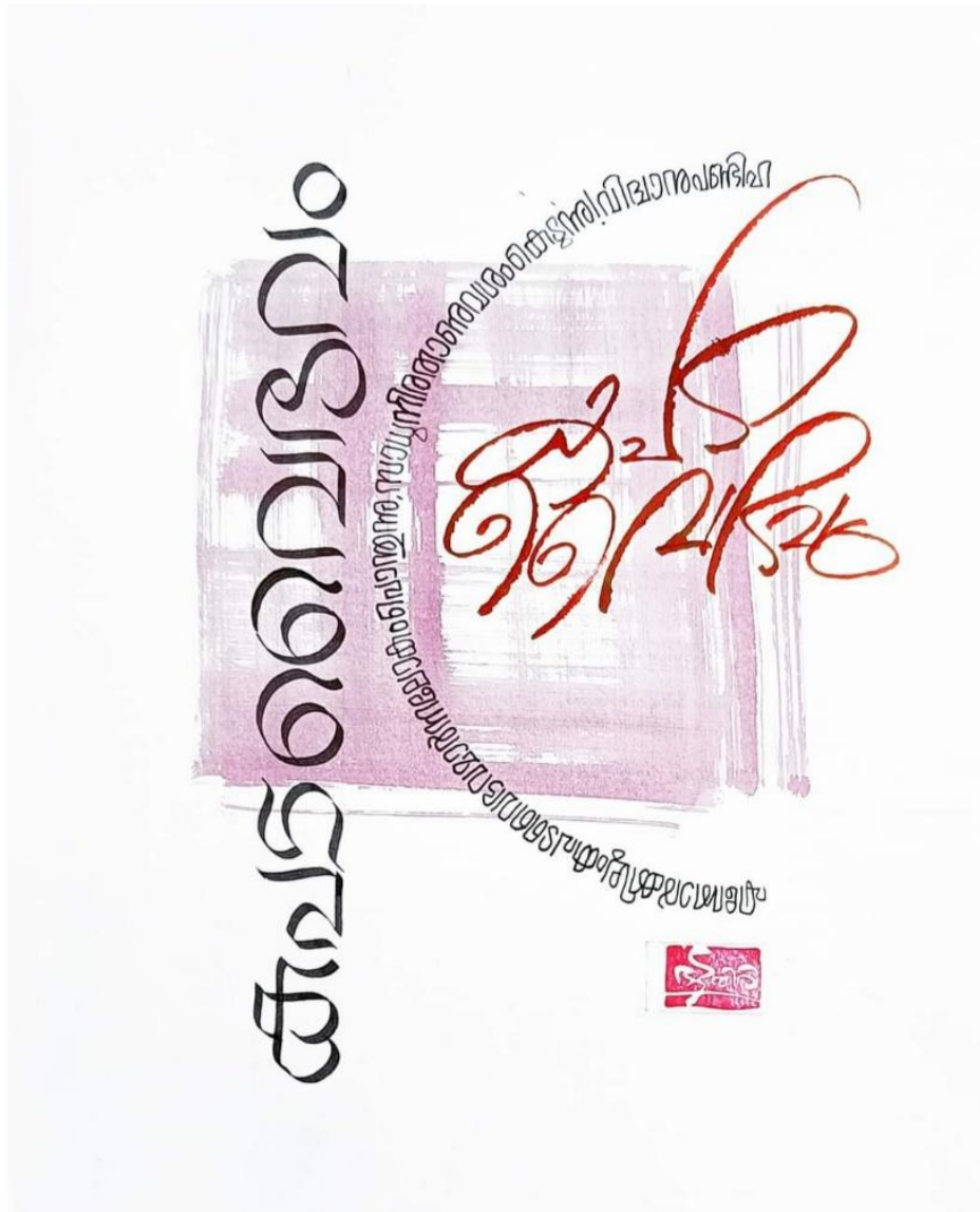
Figure.4, malayalam calligraphy 4125, mixed medium on paper, Narayana Bhattathiri, 2023

Narayana Bhattathiri's some calligraphy with pens getting a feel of cursive writing. Looking into more closely can see few combinations of letters creating a cursive writing approach. Basic Anatomy of Malayalam letters are very curvy and rounded shape this anatomy of letters Exaggerating in his pen works, some works reach to more abstract way. Second style using flate edged calligraphy it's giving the feel of traditional calligraphy styles because use of traditional calligraphy tools for this lines. Third style is using very expressive and experimental way using with stokes, spontaneous approach, speeds of action and expressions with different tools.