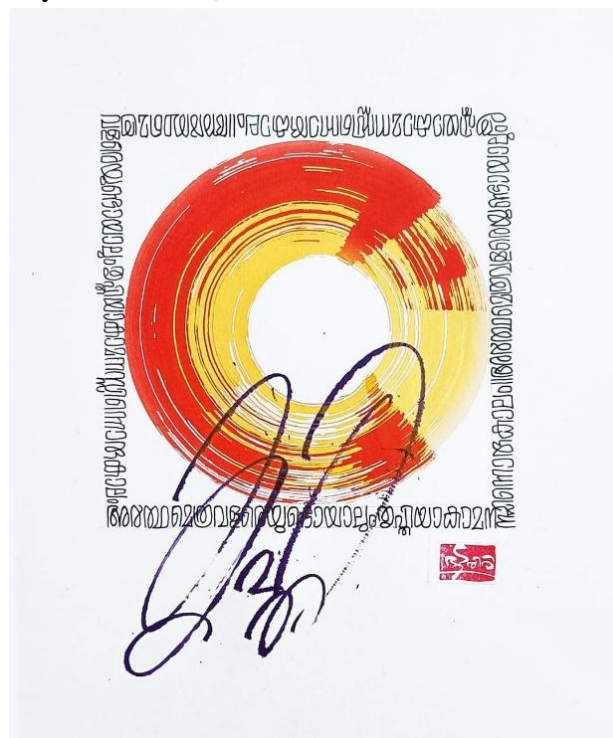
Figure.11, malayalam calligraphy 408, mixed medium on paper, Narayana Bhattathiri, 2023

Historically, black colour has been used more in calligraphy, Multiple colours are not available largely as today that time. Today in the modern calligraphy is very experimental with colours, to bring different expressions colour had important role the art works. Narayana Bhattathiri Using multiple colours in the works creating works more appealing and beautiful. Use of colours is changing very frequently in each works. sometimes with warm colours and sometimes with cool colours. In the Recent works mostly with warm colours. Using bold colour forms in the background is common in his recent works. That is the first layer of the works mostly. It creating with different tools mostly with bold brushes. Alphabets are mostly with dark colours mostly with black.\