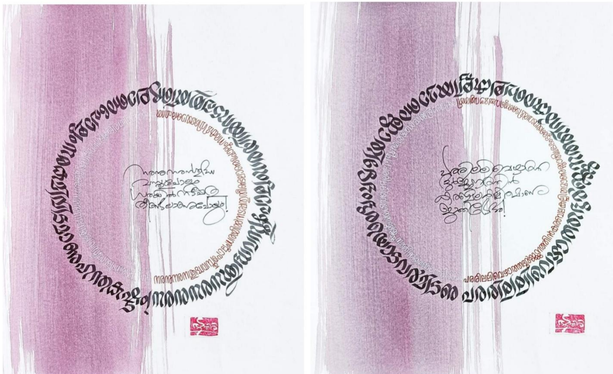
Figure 2, Malayalam calligraphy 4119 and 4118, mixed medium on paper, Narayana Bhattathiri, 2023

Figure 2 is a two recent works from Malayalam calligraphy series. Both Done in the same time. method and process is used in the works that create visual similarly each other. It can be seen a conscious effort of the artist. Each work has its own uniqueness but still the visual similarities are there, because of his method of creating work of art. He creates very spontaneous composition without any pre-planning, but into to the second works the process is flowing by artist. application of colours, use of same tools in each