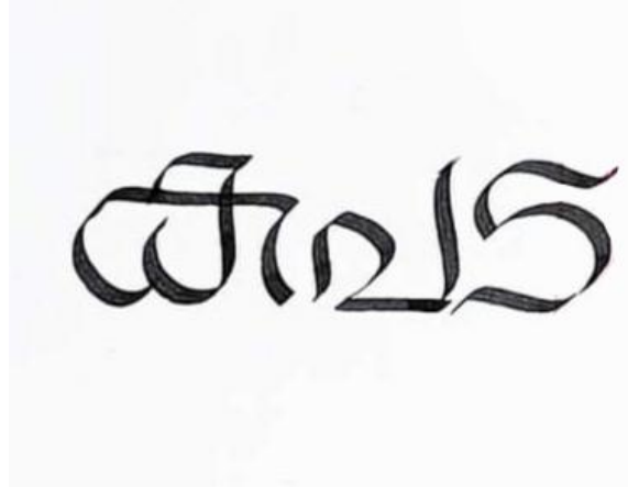
Figure.5, extract image from Malayalam calligraphy 4125, Narayana Bhattathiri, 2023