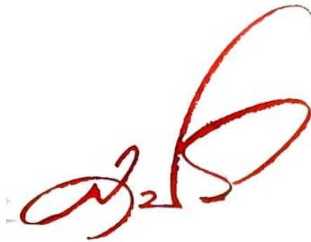
Figure.7, extract image from Malayalam calligraphy figure 4125, Narayana Bhattathiri, 202

Figure 5,6,7 are extracted images from Malayalam calligraphy 4125 To show the three different styles of calligraphy he using into the recent works. Multiple calligraphy into the creations is special in Narayana Bhattathiri works.