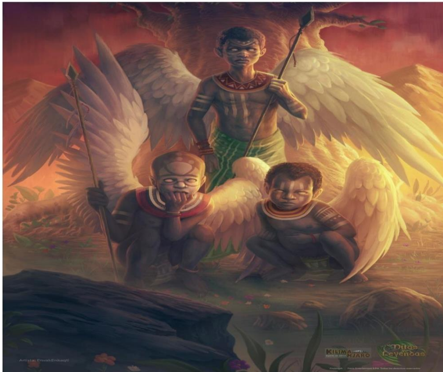
Abiku by feintbellt

This view explains the novel's presentation of the most astounding manifestations of living forces in all the dimensions of material life and also within death , discarding , above all , any imposition of a centre - oriented angle of vision . Thus the novel adopt several viewpoints and delight in highlighting the richness and variety of a hybrid world through fixing the gap between the most obvious polarities and foregrounding the syncretism of disparate elements .