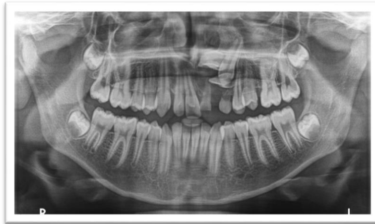
Figure.1- Ectopic Eruption

Tooth agenesis is a very common developmental dental anomaly of human dentition, and the most common dental anomaly among different ethnic groups, with third molars being the most common missing tooth.