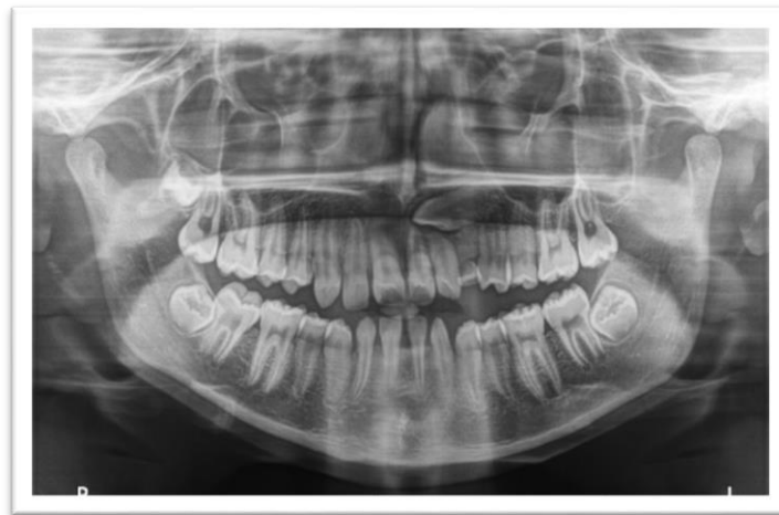
Figure.3- Impacted Canine

The prevalence of retained primary deciduous in 6–20 years old children of the Indore area. In this study, agenesis of the permanent second premolars was found to be the most common reason for the retention of the primary molar, followed by ectopic eruption of the permanent successor and impaction of the permanent successor.