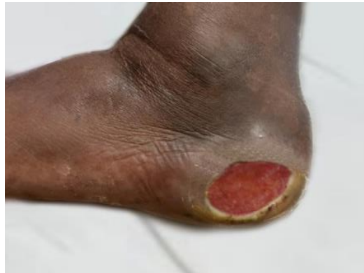
Figure 2 : Lipocolloid silver dressing 6W