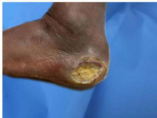
Figure 1 : Lipocolloid silver dressing Day 0

groups were compared which showed significant granulation tissue covering the wound in lipocolloid silver group than the conventional group at the end of the study. (p=0.000).( Table 6 and Table 7)