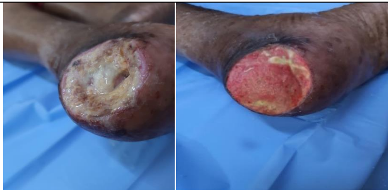
Figure 5 : Lipocolloid silver dressing at Day 0 Figure 6 : Lipocolloid silver dressing at 6W