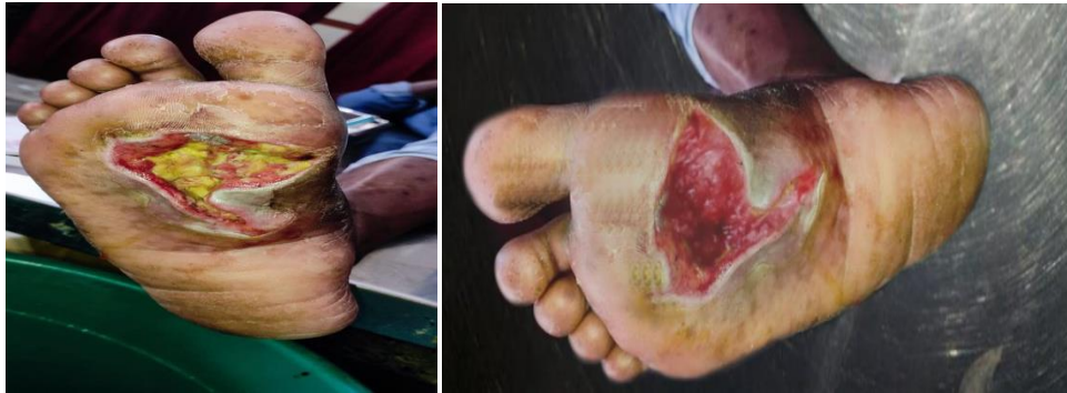
Figure 3 : Lipocolloid silver dressing at Day 0 Figure 4 : Lipocolloid silver dressing at 6W