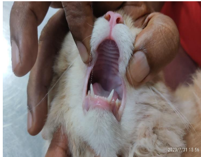
Fig. 1: Slight Pale Mucus Membrane of Cat