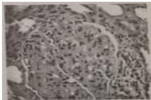
A patient with type 2 diabetes mellitus, suspecting NDRD- histopathology (H and E stain)-showing features suggestive of class 4 lupus nephritis