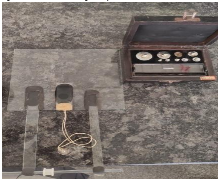
Spreadability Determination of multipurpose cream formulation.

T=Time(insec)taken to separate the slide completely each other.