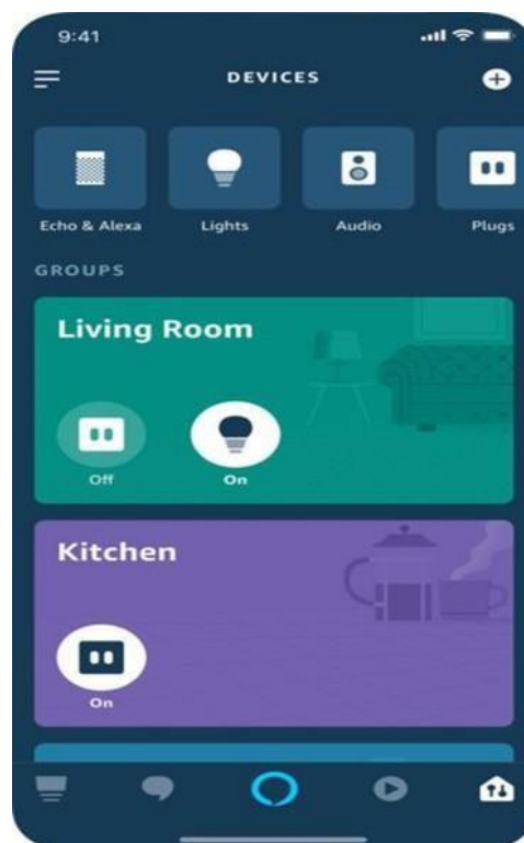
fig.3 Alexa Home Screen

Amazon Alexa, also known simply as Alexa, is a virtual assistant technology largely based on a Polish speech synthesizer named Ivana, bought by Amazon in 2013. It was first used in the Amazon Echo smart speaker and the Echo Dot, Echo Studio, and Amazon Tap speakers developed by Amazon Lab126. It is capable of voice interaction, music playback, making to-do lists, setting alarms, streaming podcasts, playing audiobooks, and providing weather, traffic, sports, and other real-time information, such as news. Alexa can also control several smart devices using itself as a home automation system. Users are able to extend the Alexa capabilities by installing "skills" (additional functionality developed by third-party vendors, in other settings more commonly called apps) such as weather programs and audio features. It uses automatic speech recognition, natural language processing, and other forms of weak AI to perform these tasks.