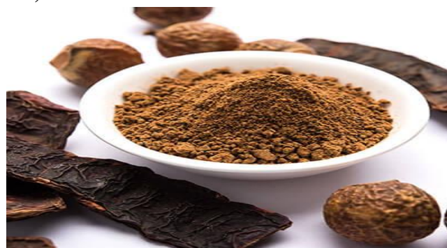
Img. 2: Shikakai