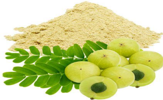
Img. 3 : Amla