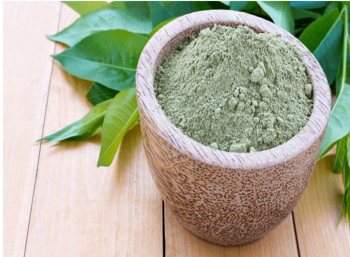
Img. 5 : Bringraj

Synonym : Kesharanjana , Keshraja , Bhunga