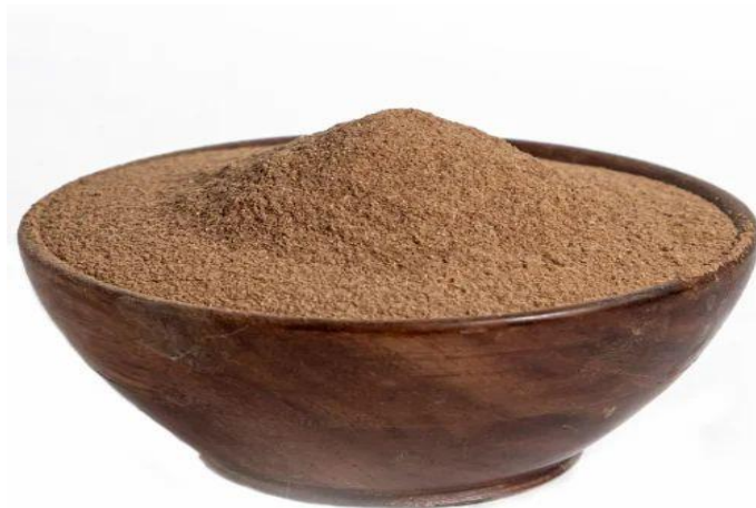
Img. 4 : Reetha