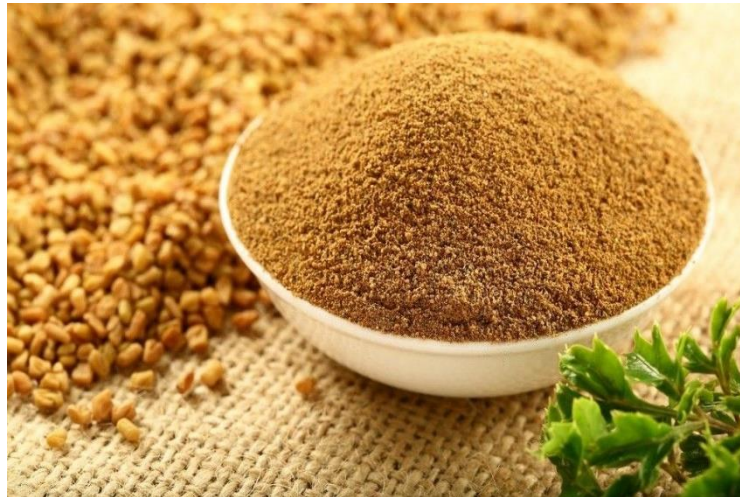
Fig 2: Fenugreek

Synonym: Methi, Fenugreek Seed, Trigonella