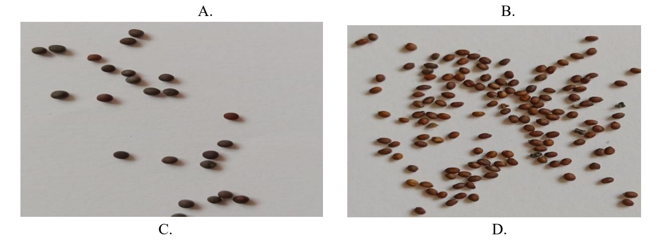
Photo Plates 2. A- Ocimum basilium B.-Ocimum tyrsiflorum C- Ocimum grattisium D-Ocimum tenuiflorum