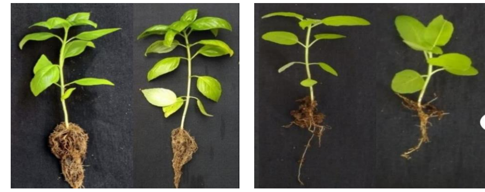
Photoplates-3 Seedlings of Two weeks Ocimum species