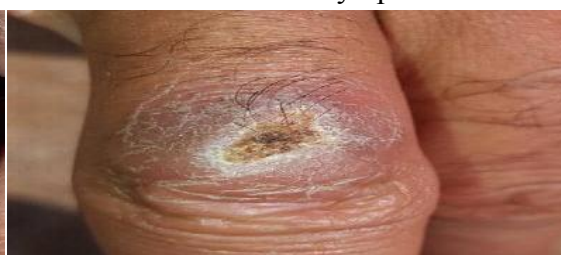
Figure (4) lishmaniasis infection after using banana peels