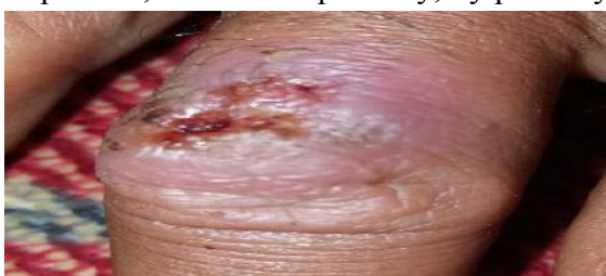
Figure (3) lishmaniasis infections on finger

After the trials we have done, eight cases have responded and healed completely, but two have not responded, and healed partially, by partially we mean their infection symptom have relived.