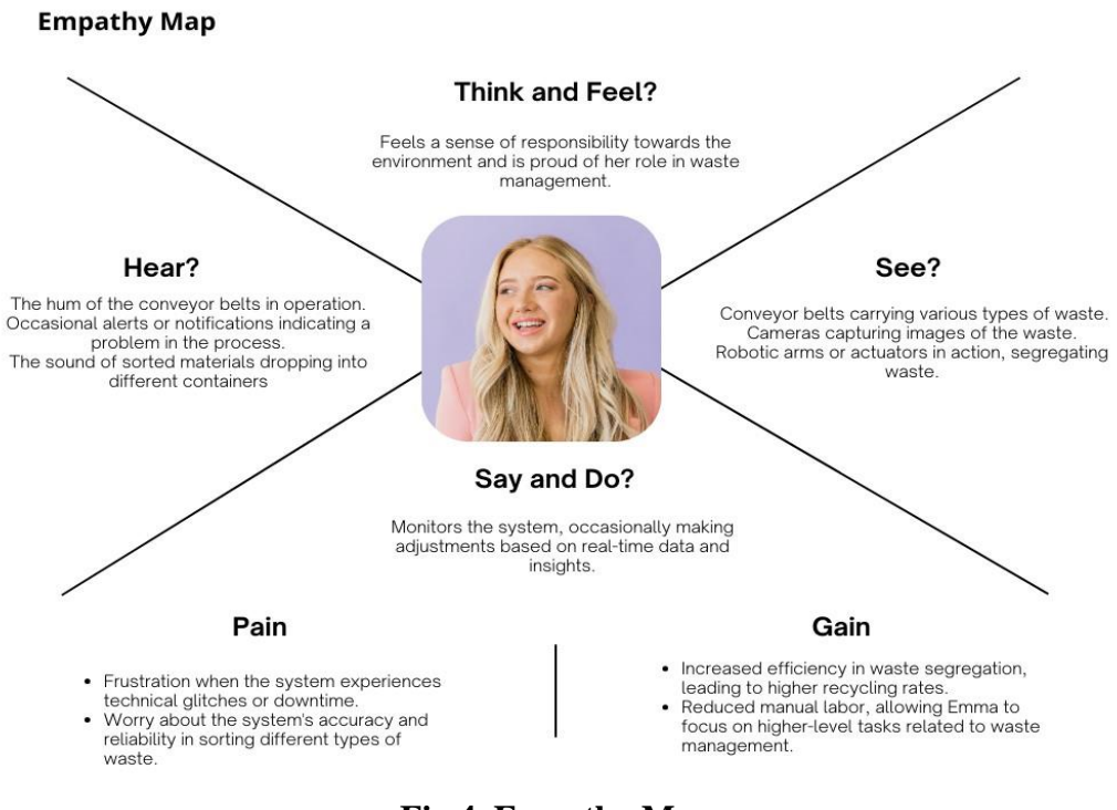
Fig 4. Empathy Map