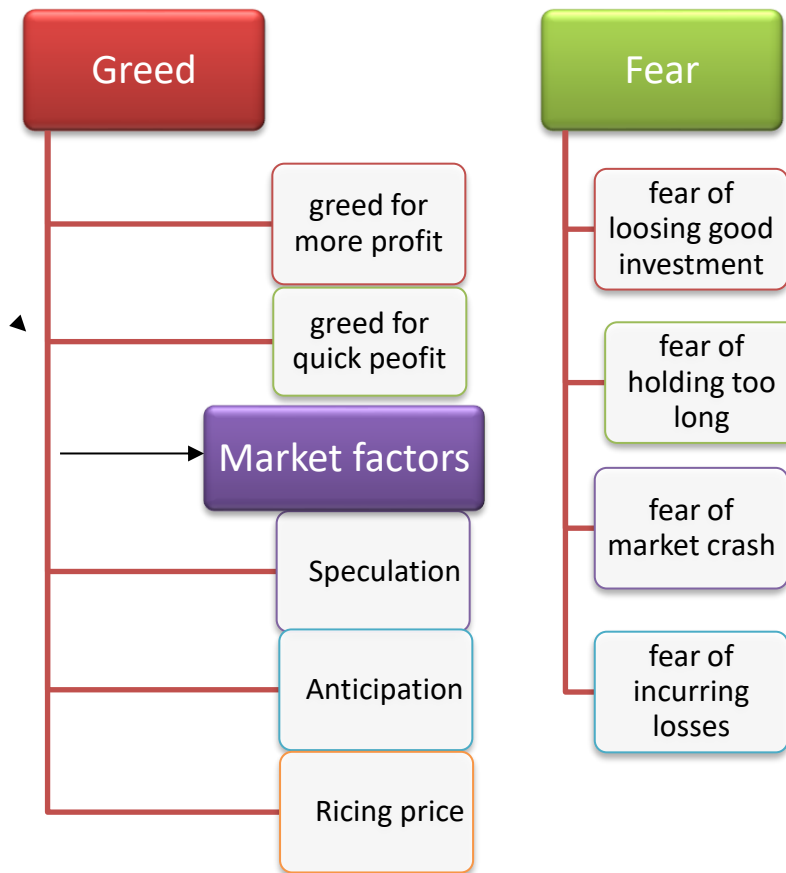
Figure1: Causes of FEAR and GREED