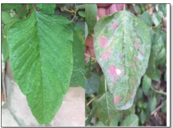
Figure 4. Healthy and unhealthy leaf

A PI camera was used to monitor the leaf disease. If a leaf disease is discovered, the name of the illness appears on the homepage.