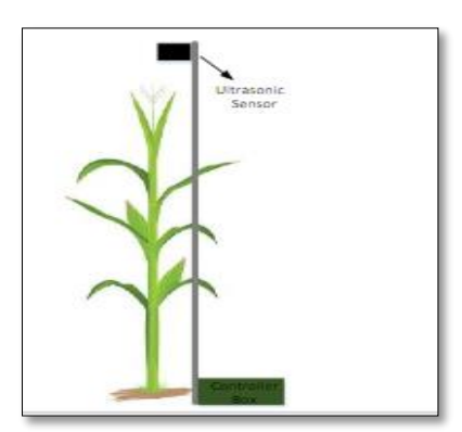
Figure 5. Layout Design

The device will be put precisely above the plant for height sensing in order to monitor the plant. Figure 3 shows the layout concept for placing the ultrasonic sensor.