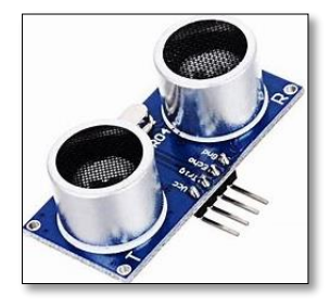
Figure 2. Ultrasonic sensor Water level sensor