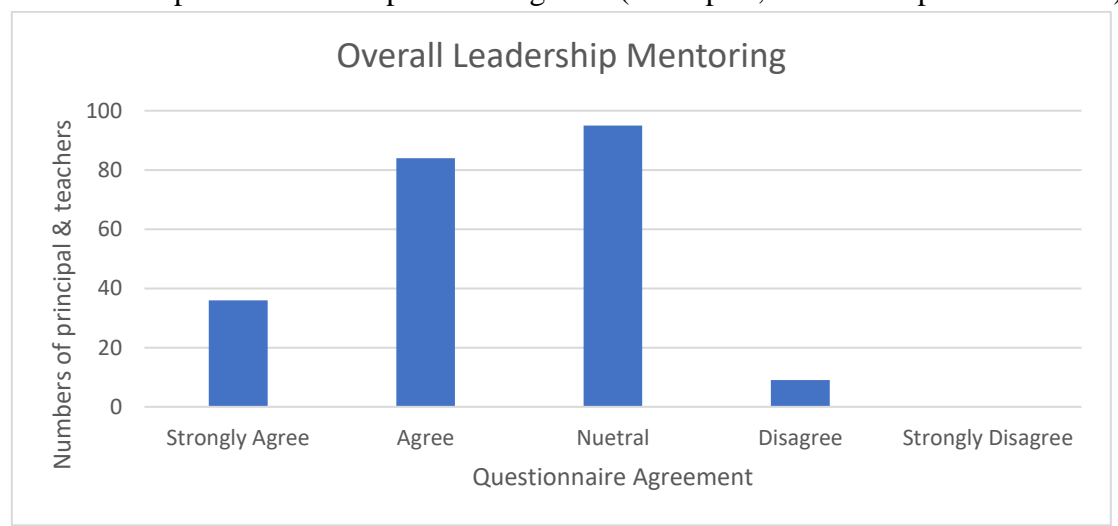
Figure 1 Overall Perceptions Leadership Mentoring with (Principals, Vice Principal & Teachers)

Table 5 indicates overall mean (M=4.59) and standard deviation (SD=0.04). The mean of each item ranges from 4.51-5.00 and falls under the strongly agreed category. It revealed that mentors provide valuable guidance and experience a positive impact on their leadership growth. Almost all student respondents were for the mentorship in the school.