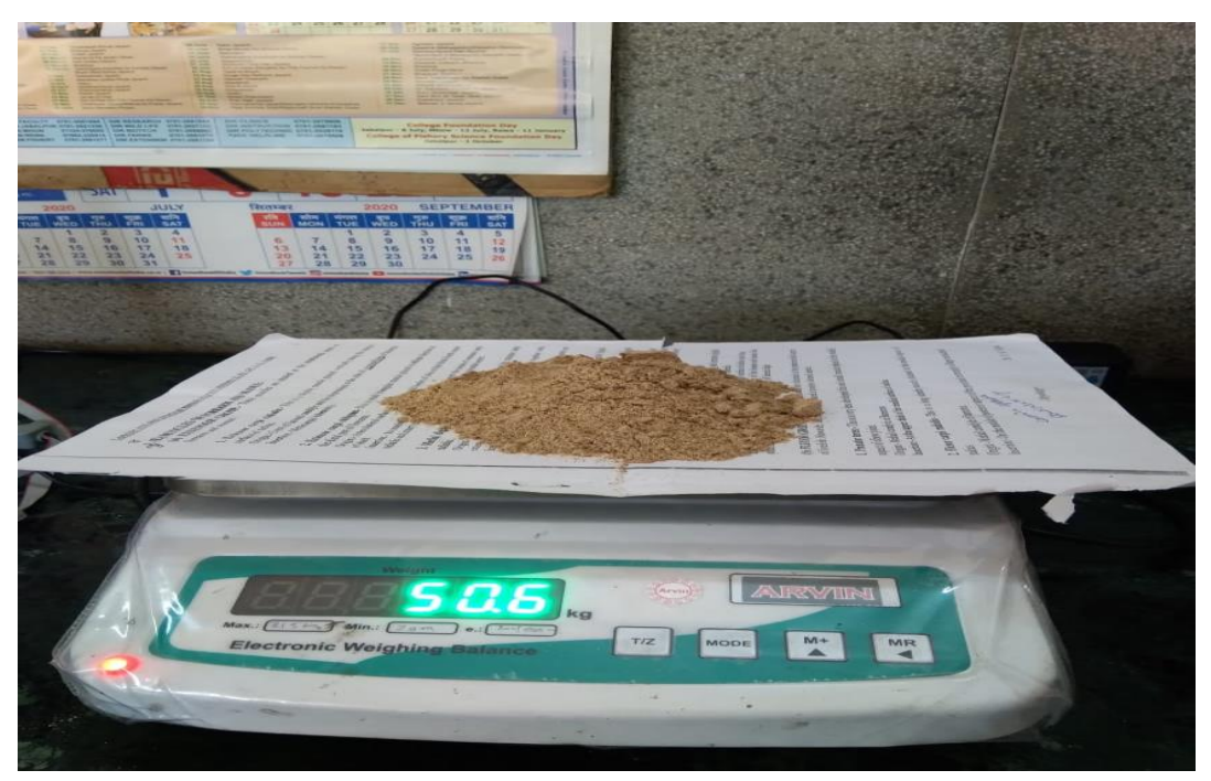
Plate 3. Grounded powder of palash seeds

E-ISSN: 2582-2160 • Website: <u>www.ijfmr.com</u> • Email: editor@ijfmr.com