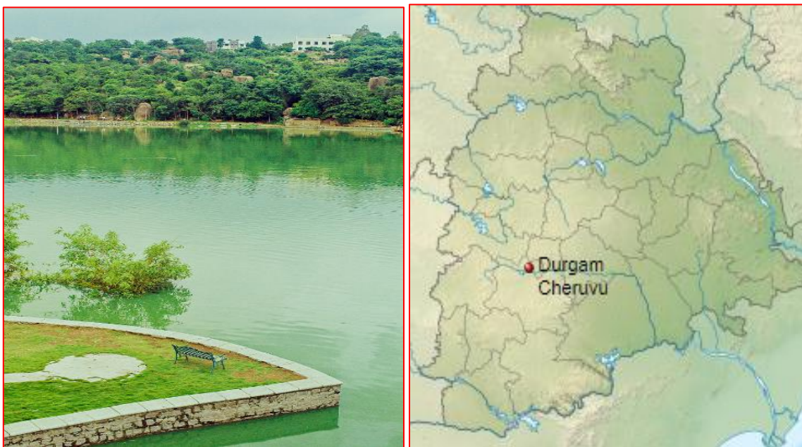
Fig.1 Showing Durgam Cheruvu over view-Map

The phenomenon has resulted in a swift alteration in the lake's biota. The lake has seen notable transformations in previous years, resulting in increased pollution as a consequence of human actions such as the release of domestic wastewater and the construction of road embankments. Over an extended period, this system has emerged as a paradigmatic framework for doing research on freshwater ecosystems (Fig-1). In 2006, the local pollution control board established sewage treatment plants as a means to address the issue of pollution in the lake. Over the course of time, the factory ceased to operate. In 2022, the Hyderabad Metropolitan Water Supply and Sewerage Board established a distinct sewerage treatment plant (STP) at Durgam Cheruvu, after the approval of the Government of Telangana.[10]