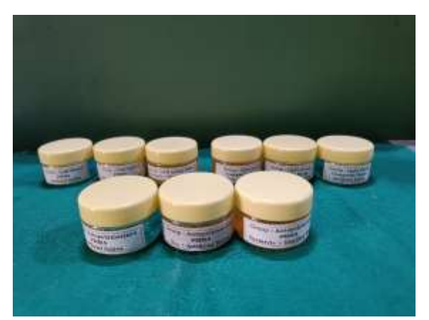
Figure 2: Samples immersed in coloring solutions

Specimens were immersed in their respective solutions at 37°C. The solution was changed every 3 days and stirred twice daily. Color measurements were made before immersion (T0), after 1 day (T1), 1 week (T2), and 1 month (T3). The specimens were rinsed with distilled water for 5 min and blotted dry with tissue paper before color measurement.