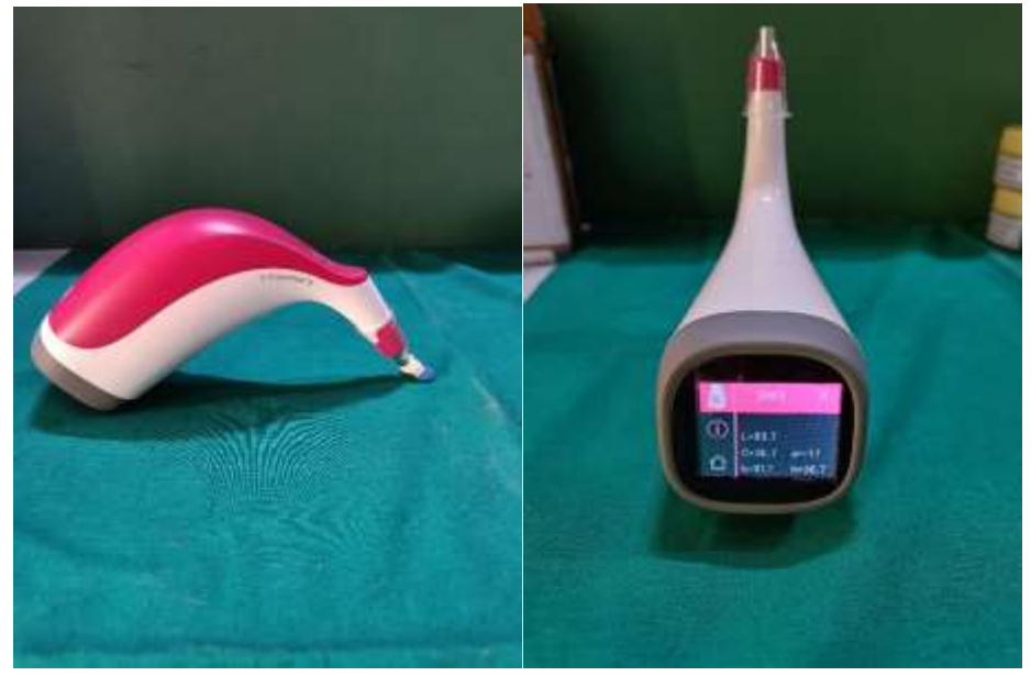
Figure 3: Spectrophotometer for analysis of color change at different time intervals

Where the initial (i) and final (f) are color descriptors and L*, a*, and b * are differences in color parameters for the two specimens measured for comparison.