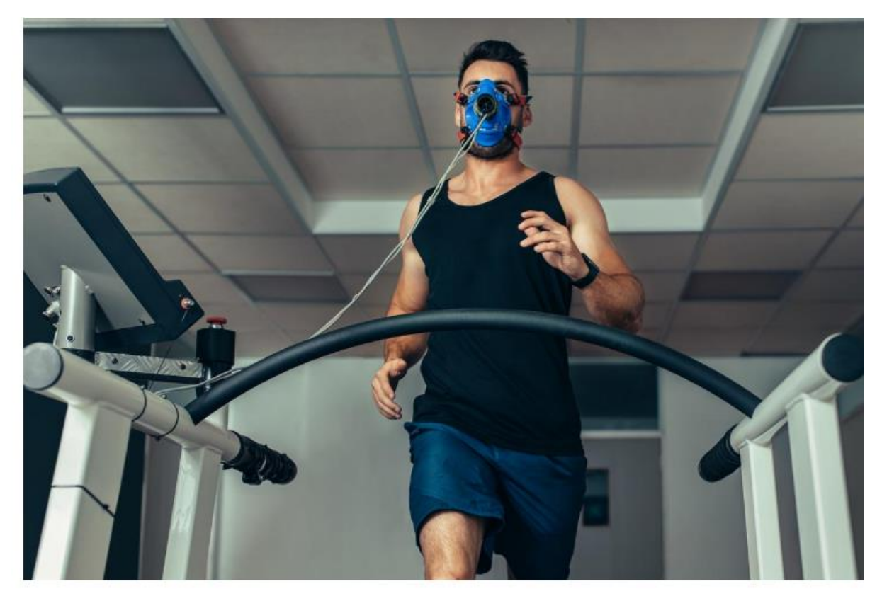
Figure 3. Anaerobic threshold analysis

J. Darren (2015), Advancements in sports equipment have transformed athletic competition, with engineers continuously innovating to create gear that can elevate performance levels. However, not all athletes are able to harness the benefits of these cutting-edge advancements, and in some cases, their performance may even suffer. Despite the sound engineering behind these developments, there is often a critical element missing: the interaction between the equipment, the athlete, and the action itself. While a piece of equipment may be mechanically flawless in isolation, it transforms into a biomechanical system once it interacts with the athlete. Biomechanical studies play a pivotal role in unraveling the underlying mechanisms of performance in sports. These studies shed light on crucial performance metrics and injury variables that can be influenced by sports equipment.[5]