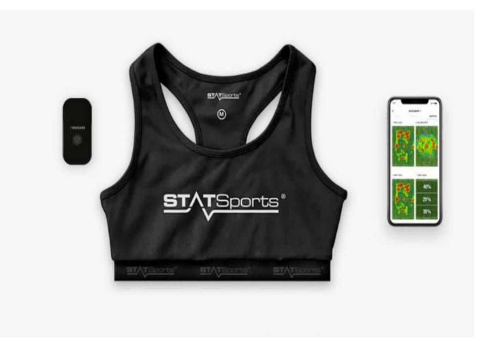
Figure 2. GPS enabled Athlete tracker

Barbu et. al (2018), the study of sports equipment, whether for recreational or competitive use, has emerged as a burgeoning field of applied research. Professional-grade equipment, with its emphasis on both functionality and sensory comfort, has increasingly taken on the role of a fashionable accessory. Its aesthetic appeal can wield a psychological influence that may affect the outcome of a competition. This paper proposes an examination of how manufacturing technologies employed in sports equipment production impact performance, employing a SWOT analysis to delineate the strengths, weaknesses, opportunities, and threats associated with a specific type of equipment. Furthermore, a case study is presented with the objectives of assessing equipment comfort attributed to finishing technologies and evaluating the visual impact of color choices. Statistical analysis will be utilized to process the study's findings, with the resulting conclusions providing valuable insights for selecting equipment conducive to achieving high-performance results.[2]