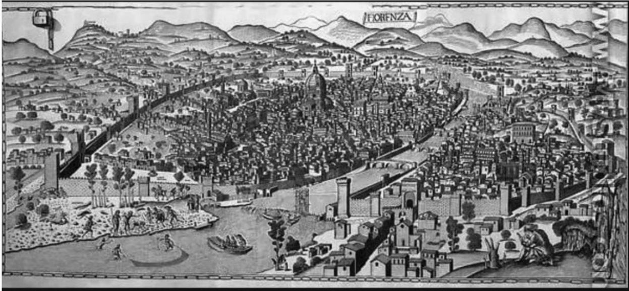
Florence during the renaissance epoch