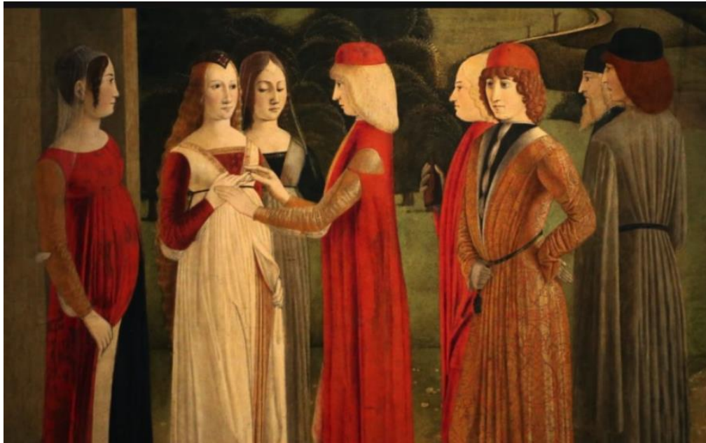
Renaissance image depicting fashion amongst Nobility in Florence

nobility of Europe. (Currie E. 2008) This fusion of cultures was evident in Florence's textile and clothing market, which started getting influenced by Eastern fabrics and designs. The city's silk industry, for example, was heavily influenced by the silk trade with China and the Middle East, which introduced new techniques and designs to Florence. Florentine weavers could produce intricate and exquisite designs inspired by Eastern patterns and motifs. (Lemire, Riello 2008), (Currie E. 2008).