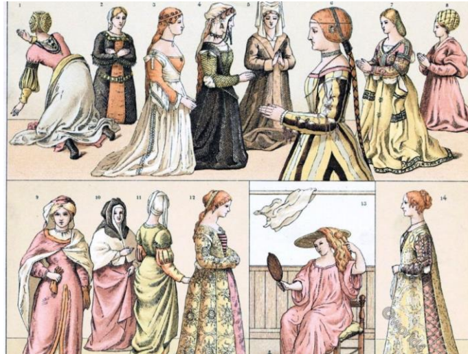
Nobility vs Second-hand clothing. Notice the layering in women clothing.

a fashion trendsetter motivated and shaped the story of fashion in Florence and women were mostly the driving force for it.