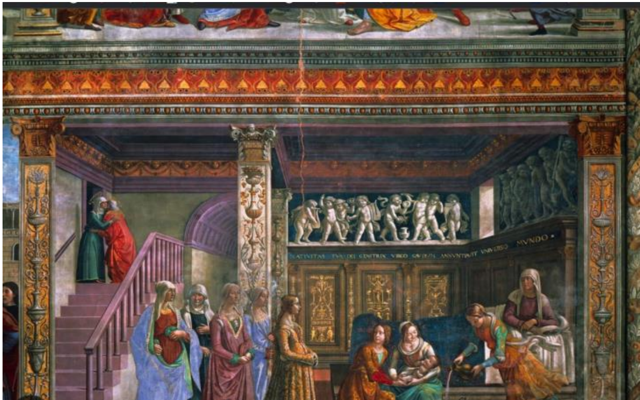
Depiction of Royalty through clothes.