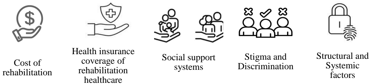
Figure 2: Factors that Influence PWUD Utilisation of Rehabilitation Services

Lack of financial resources was similarly identified as a significant barrier to seeking rehabilitation healthcare. Participants reported that individuals and families experiencing financial stress often could not afford the cost of care, leading them to forgo seeking rehabilitation, or opting for other non-medical options such as prayer camps, despite their willingness to get formal rehabilitation.