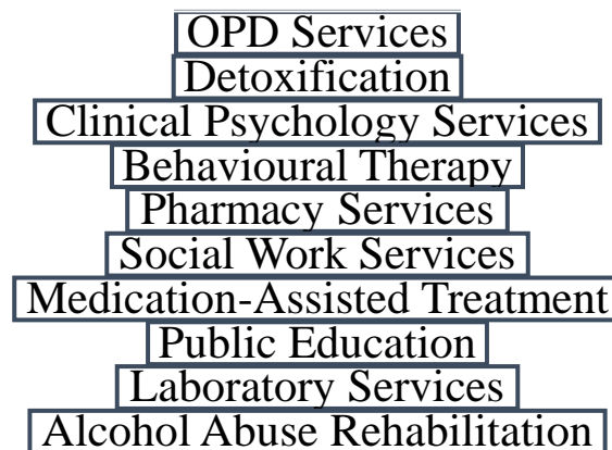
Figure 1: Services Offered at Rehabilitation Facilities

Medication-Assisted Treatment (MAT) was found to be an essential component of rehabilitation healthcare, involving providing counseling and medication to aid individuals in their recovery process. Aside medical practitioners, counsellors impart personal hygiene skills, home maintenance, and social interaction skills to PWUD as reported by respondents.