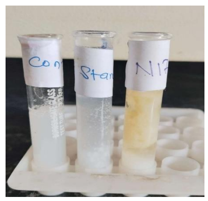
Fig. No. 2 Method of Tests

Table No. 3 Compare percent inhibition of Sample with standard