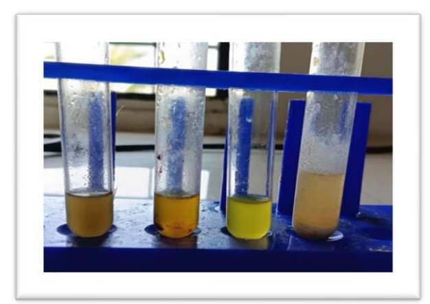
Fig. No. 2 Test for Alkaloid Present

Analysis of Extract by GC-MS Technique- In that the seven compounds were identified in Murraya koenigii roots extract by GC-MS analysis. The active principles with their Retention time (RT), Injection time (IT), Flow time (FT) and Concentration (%) are presented in (Table No. 2). The prevailing compounds were Dimethyl ether(59.68%), Formamide(17.25), 1,3-Butadiyne(6.98),Silane, methyl-(5.60)