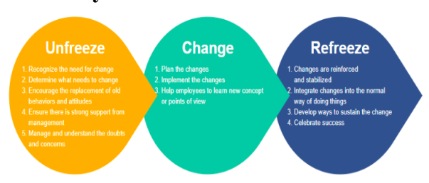
Figure 2: Lewin's Change Management Theory

This study was anchored on Kurt Lewin's Change Management Theory. Lewin's Change Management Model is foundational to understanding and implementing organizational change. It was based on three main stages: Unfreeze, Change, and Refreeze. This theory could effectively be anchored to implementing an Electronic Budget (eBudget) system and Electronic New Government Accounting System (eNGAS) within an organization of the DPWH Surigao del Norte Province.