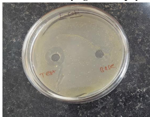
Fig .6.2 Anti-bacterial activity against Escherichia coli