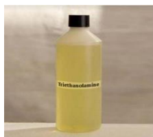
Fig no. 5.9