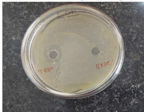
Fig .6.2 Anti-bacterial activity against Escherichia coli