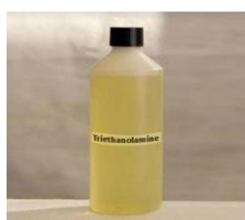
Fig no. 5.9