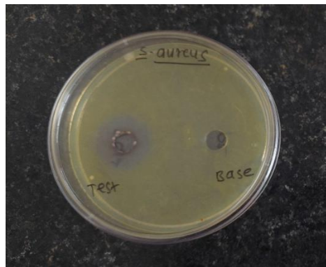
Fig 6.1. Anti-bacterial activity against Staphylococcus aureus