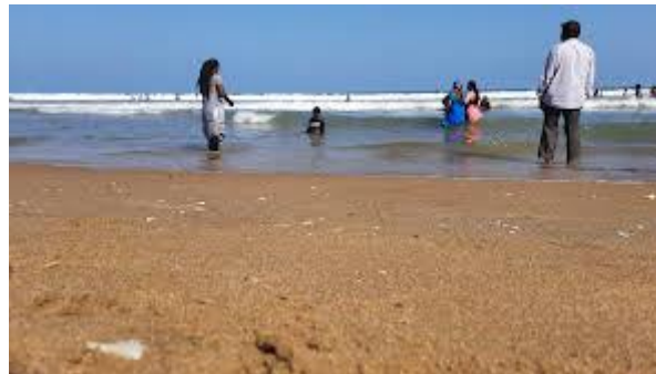
KOTHA KODURU BEACH

Kotha Koduru beach located in Thotapalliguduru Mandal of Nellore District. This beach area famous for Christian's. Marry Matha (Velankanni) church located here. In this area also attracted the tourists. Hindu's also used to visit here and worshiped Marry Matha. Fishing, Boat racing famous here APTDC also recognized Kotha Koduru Beach as tourist attracted place. In Sunday number of peoples visited to this beach.