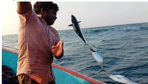
PYNAMPURAM BEACH & FISH HUNTING

Pynapuram beach located in Muthukuru Mandal of SPSR Nellore District. Sundays and other holidays we observe here crowded in beach. Tourists used to here for fish hunting, boating and also health tourism. This area famous for Aqua products. Such as Prawn, Sea Fish etc.,