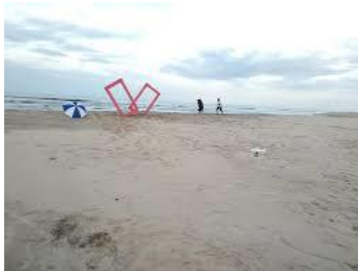
Iskapalli Beach – Photo shoot

Iskapalli beach located in Alluru mandal of Nellore SPSR Nellore District. This beach area famous for boating, fish hunting, salt making etc., In holidays tourists attracted for this place and stay here.