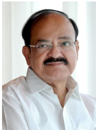
- Moppavarapu Venkaiah Naidu