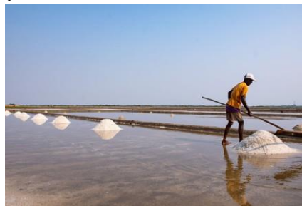
Gangapatnam Beach – Salt making

Gangapatnam beach located in Indukurpeta Mandal of SPSR Nellore District. This area also called as Armugam in the hands of European's fishermen's families settled here and they export fish & prawn to the district head quarter. Tourists attracted with beach tidal waves. Gangapatnam Chamundeswari Ammavari Temple famous nationally. From this beach water we observe salt making.