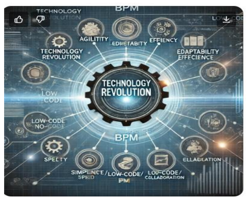
Here's a diagram illustrating the relationship between the technology revolution and its impact on BPM, highlighting the transition from traditional BPM methods to low-code/no-code platforms. Let me know if you need any adjustments!

E-ISSN: 2582-2160 • Website: www.ijfmr.com • Email: editor@ijfmr.com