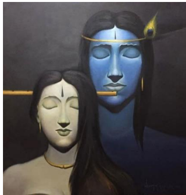
Figure 9, "Radha-Krishna" painting by Wasim Kapoor

Krishna, oil on canvas by Wasim Kapoor, [36" x 60"]