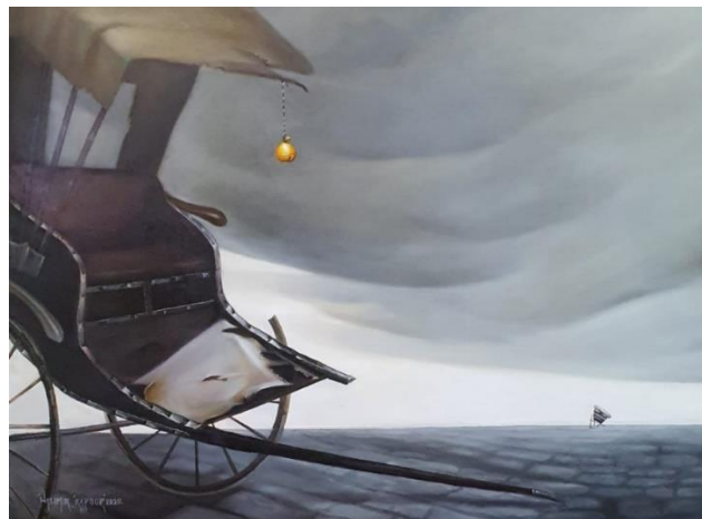
Figure 1, 'Hand Rikshaw' series by Wasim Kapoor

Keywords: Wasim Kapoor, Artist, Contemporary Art, Indian Artist