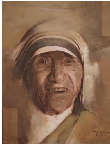
Figure 2, "Mother Teresa" painting by Wasim Kapoor