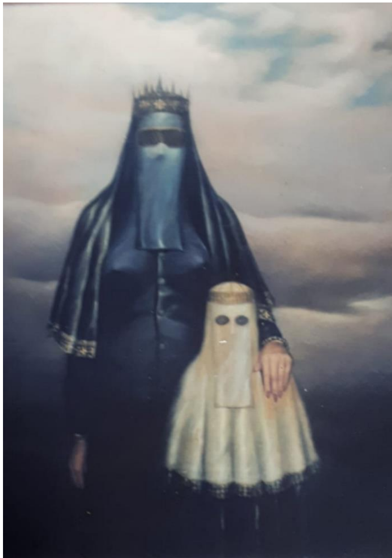
Figure 7, "Burkha" series by Wasim Kapoor

Burkha series, Oil on Canvas by Wasim Kapoor, 1983. [5ft. x 4ft.] This masterpiece painting of Wasim Kapoor merely represents the tropical rituals of Muslim society, where every married woman has to wear a Burkha for the sake of their rituals. There is no doubt about the medium; it is of oil and excellent study with an excessive flow of concept.