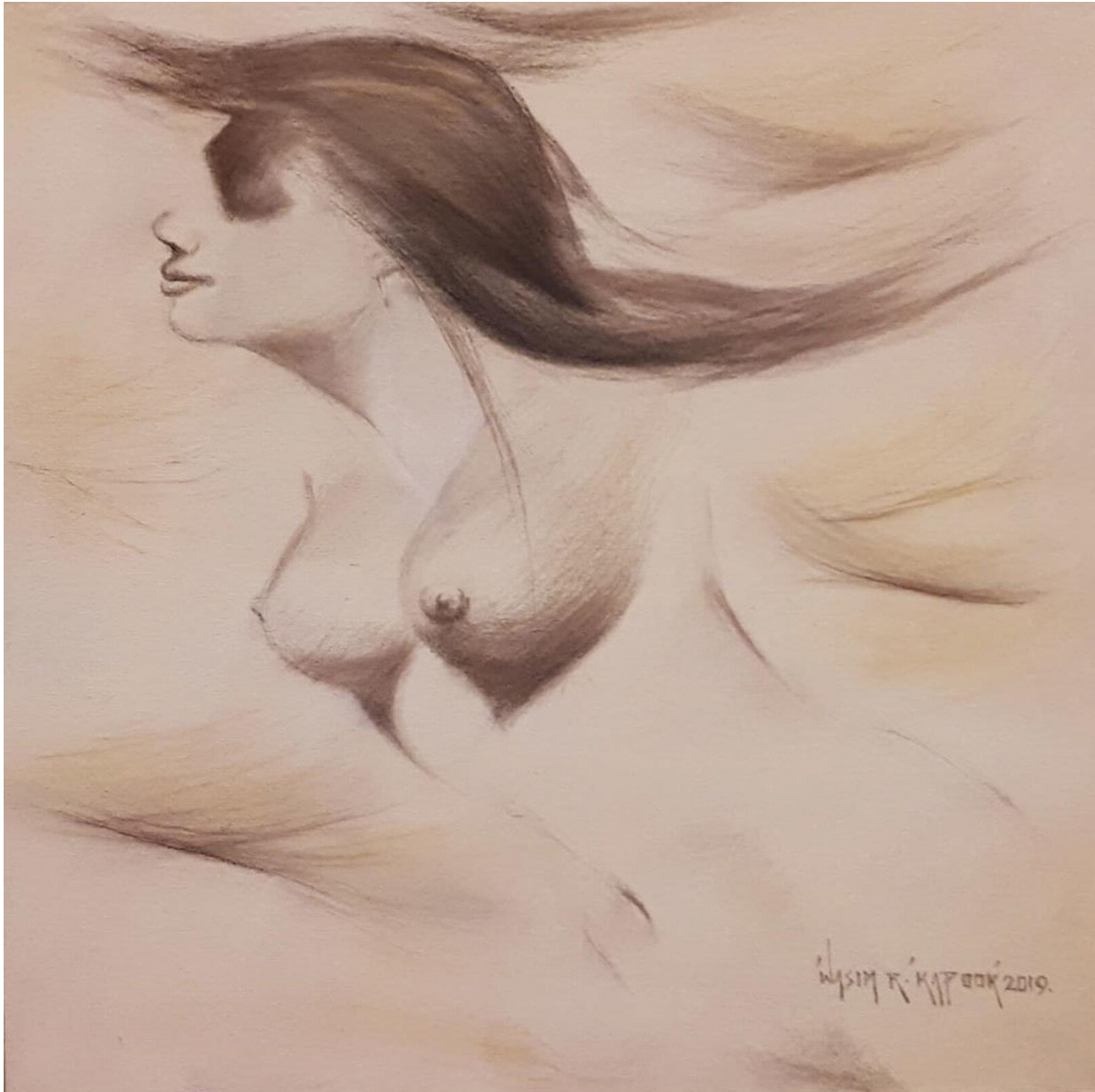
Figure 6, "Untitled" conte drawing by Wasim Kapoor

Untitled, conte on canvas by Wasim Kapoor, 2019. [24" x 24" inches]