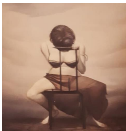
Figure 5, "Prostitute" series by Wasim Kapoor

Here, the realistic skills of the artist can be seen. As shown in the image, Wasim Kapoor is an excellent contemporary artist who creates proportionate realistic figures.