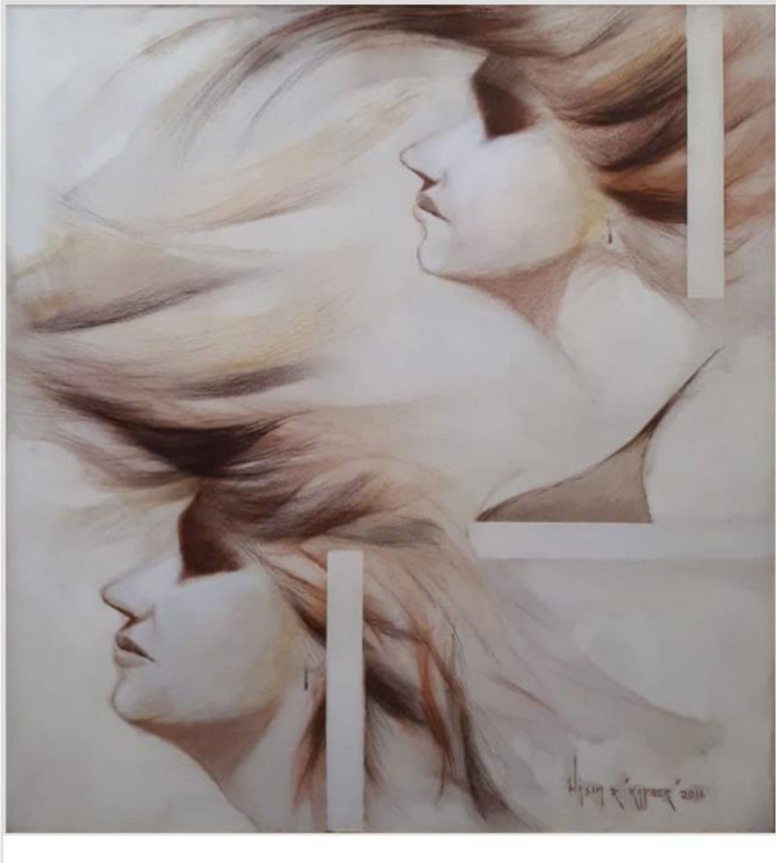
Figure 14, Duet Women, conte on canvas by Wasim Kapoor

Duet woman, conte on canvas by Wasim Kapoor, 2019. [41" x 41"]