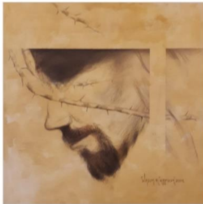
Figure 13, "Jesus" in conte drawing by Wasim Kapoor

This Conte drawing is from Wasim Kapoor's Jesus series. This series is all about the unnecessary torturing of innocent lives who have done no harm to others yet are suffering from the torture. One can observe the portrait of Jesus bounded with barbed wire. Here, Wasim Kapoor drew the same character as Jesus to depict the ordinary person of our society living in almost the same situation in a similar position as Jesus. The character is innocent but trapped in society's dirty politics, leading him to suffer and feel immense pain like the mythological character Jesus.