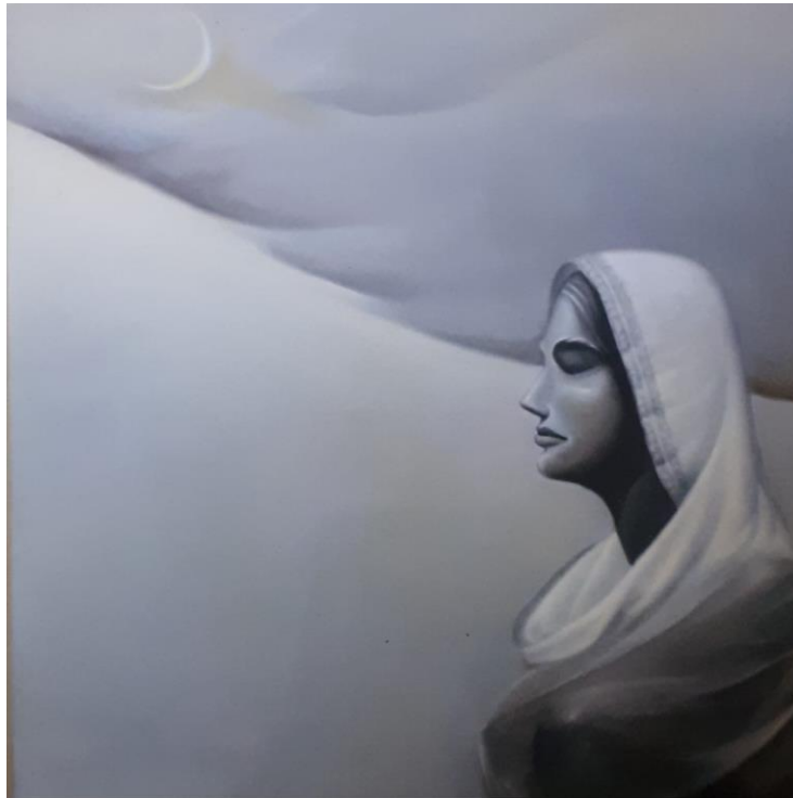
Figure 15, "Untitled" painting by Wasim Kapoor