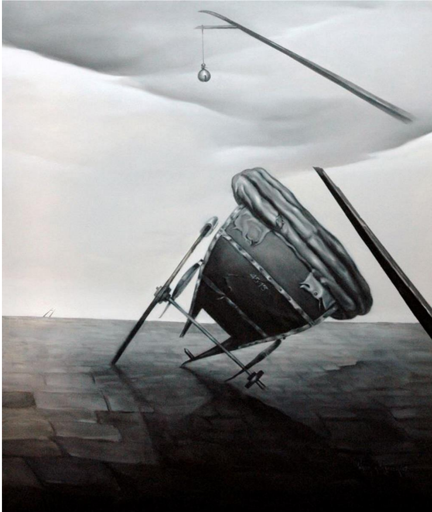
Figure 8, "Hand Rikshaw" series by Wasim Kapoor

Rikshaw, oil on canvas by Wasim Kapoor, 2007. [66” x 54” inches]