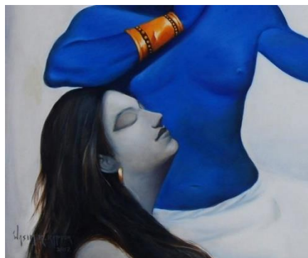
Figure 11, "Radha-Krishna" painting by Wasim Kapoor