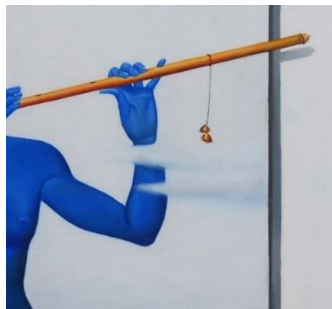
Figure 10, "Radha-Krishna" painting by Wasim Kapoor