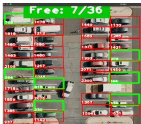
The above data is pictured in the next graph.