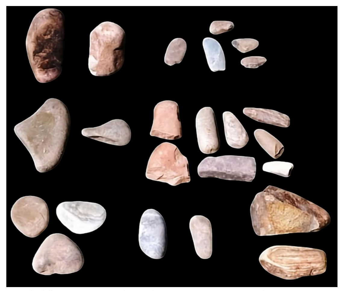
Fig 4 Stone axe head, chisel, pointed arrowheads, pestle, discs and blade

E-ISSN: 2582-2160 • Website: <a href="www.ijfmr.com">www.ijfmr.com</a> • Email: editor@ijfmr.com