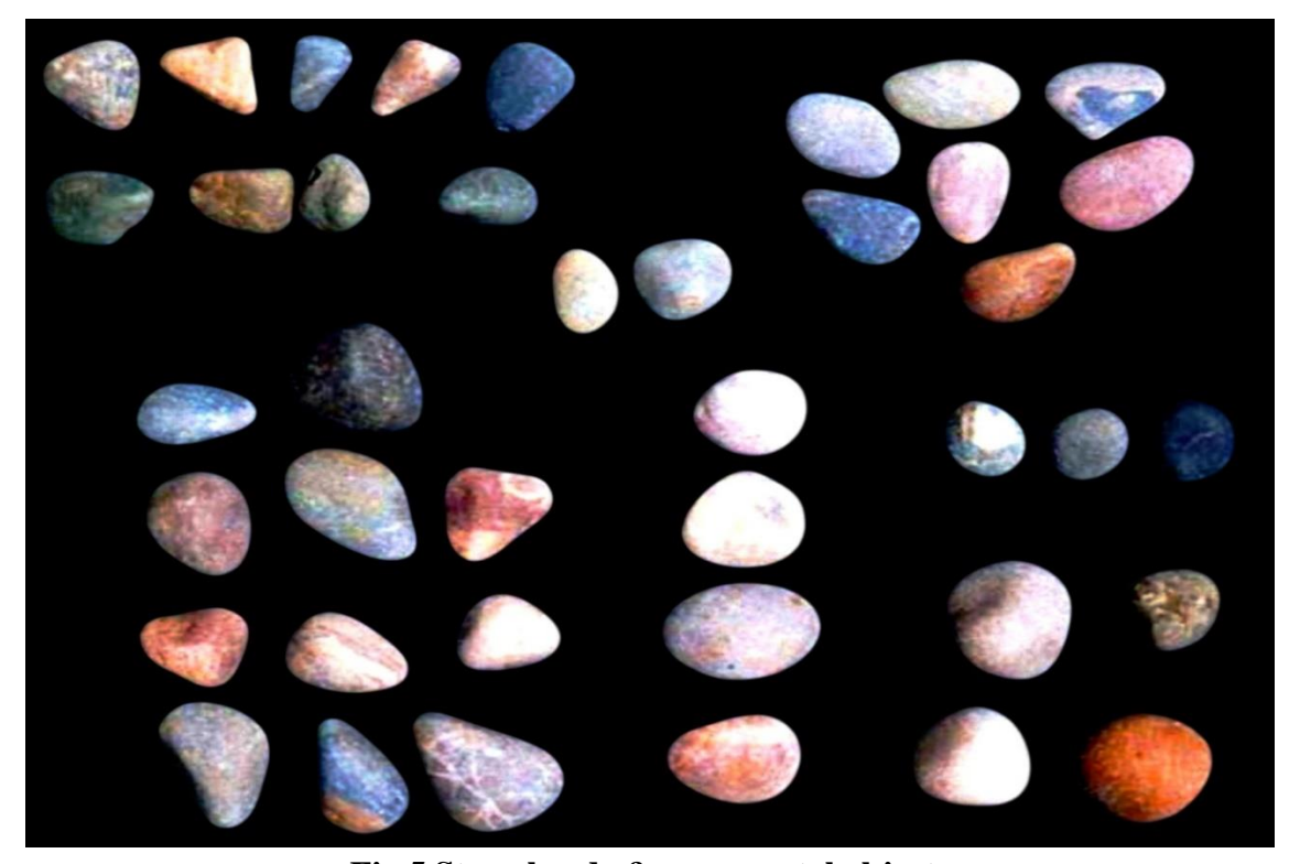
Fig 5 Stone beads & ornamental objects