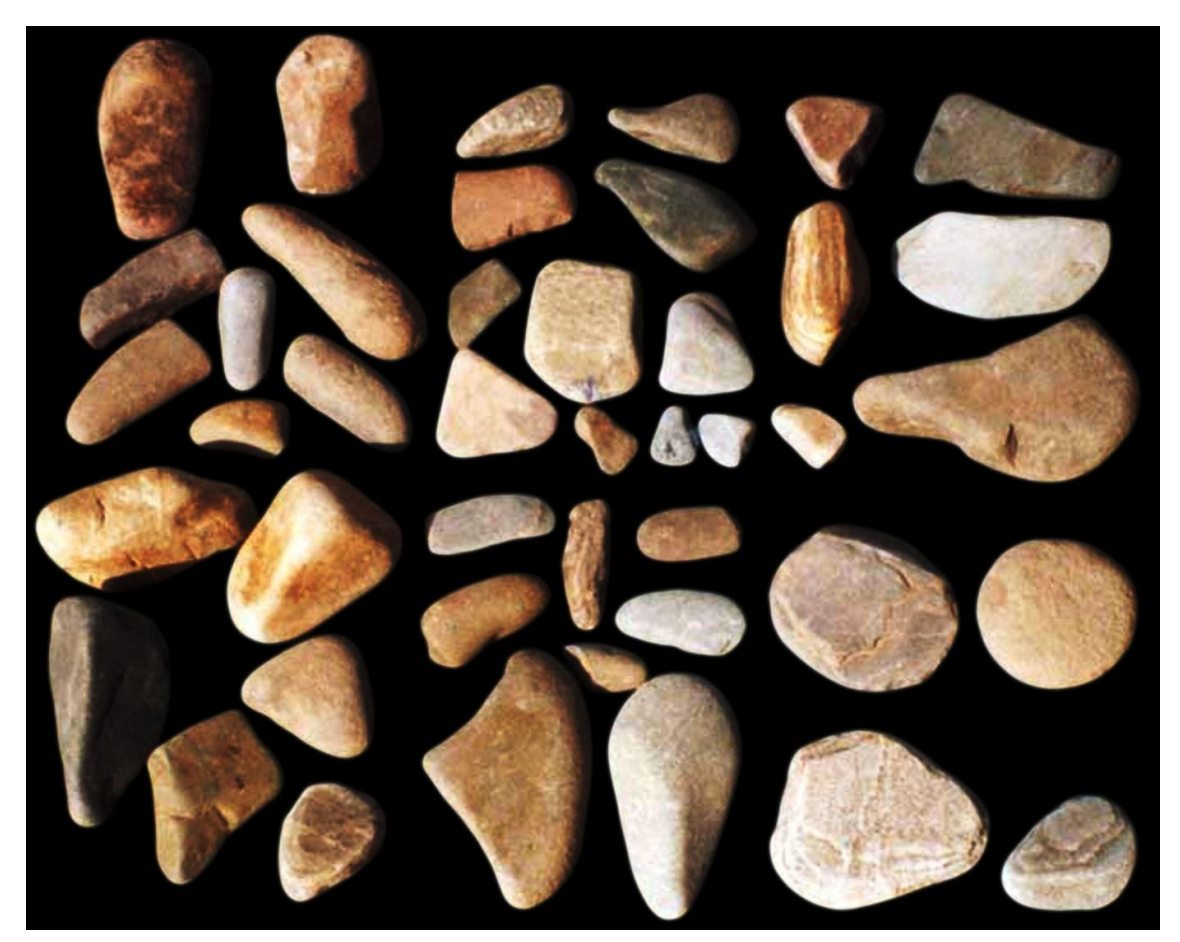
Fig 3 Stone weapons like spearhead, arrowheads, discs, axe and pointed stone objects