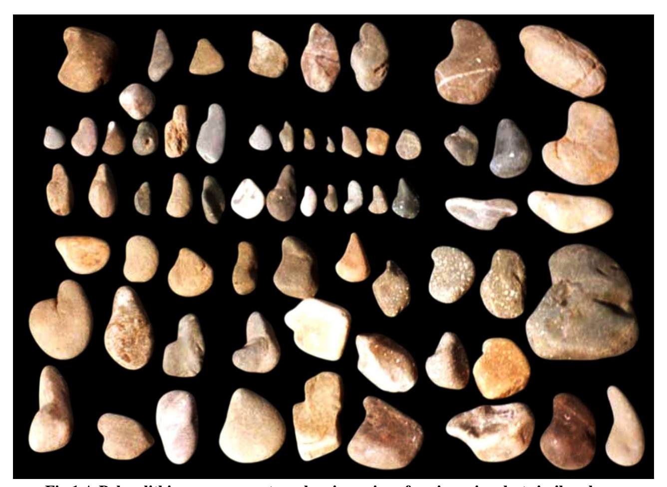
Fig 1 A Palaeolithic currency system showing coins of various sizes but similar shape