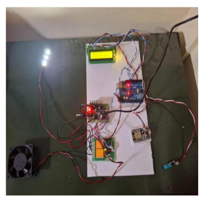
Fig.2 Sericulture Circuit Setup