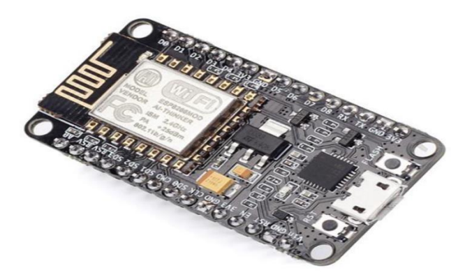
Fig.3 Node MCU v2 WIFI MODULE

Arduino-style hardware IO with a PCB antenna features an advanced API for hardware interaction, significantly minimizing redundant tasks related to configuration and control. It operates like Arduino but allows interactive coding using Lua script.