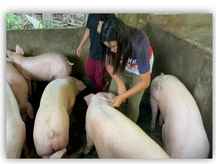
Figure 2. Sample documentation during the conduct of the study

Linear relationship between different external body measurements in the prediction of weight of Philippine Native and commercial pigs was analyzed using the correlation of the SAS Software. The degree of correlation was categorized into 4 levels: high [correlation coefficient (r) \ge 0.60], moderate (0.60 > r \ge 0.30), low (r < 0.30), and non-significant (P>0.05).