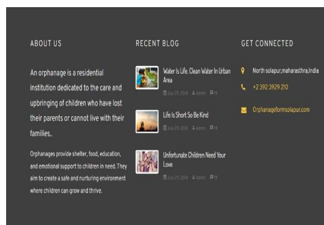
Figure 2. About us / Contact Us