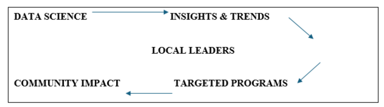
TRANSFORMATIVE EFFECTS OF DATA SCIENCE ON BUSINESS

In 2025, the effects of data science on society are profound, with the global data volume expected to reach 175 zettabytes and over 38.6 billion IoT devices connected. This growth enhances decision-making, drives innovation in healthcare, and improves public services, ultimately fostering a more data-driven and transparent society. It addresses complex societal challenges through data-driven approaches, encourages transparency in processes, and empowers both individuals and organizations to utilize insights for the greater good.